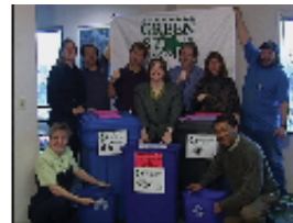
The Corporate Express Green Team, Certified in 2007